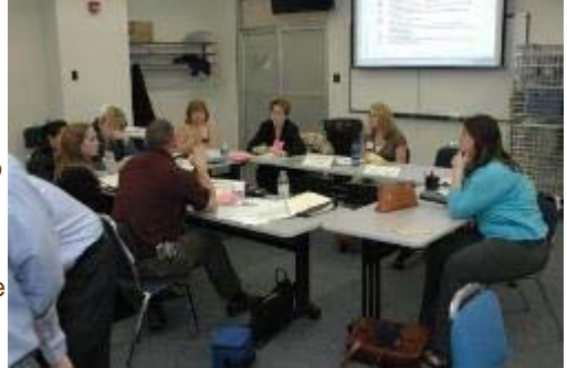
Ohio Department of Health (ODH) partners become oriented to the ODH Department Operation Center during a CDC exercise April 25 – 26.

The Ohio Department of Health (ODH) used the opportunity to orient staff to the newly created ODH Department Operations Center (DOC). During the exercise, ODH staff reviewed DOC procedures and evaluated DOC resources, technology and support functions.